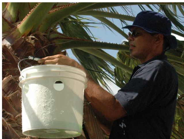
Figure 14. Homemade R. ferrugineus trap with entrance holes (Image courtesy of Amy Roda, USDA-APHIS).