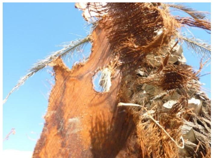
Figure 6. Damaged palm frond caused by R. palmarum (Image courtesy of Center for Invasive Species Research, University of California, Riverside).