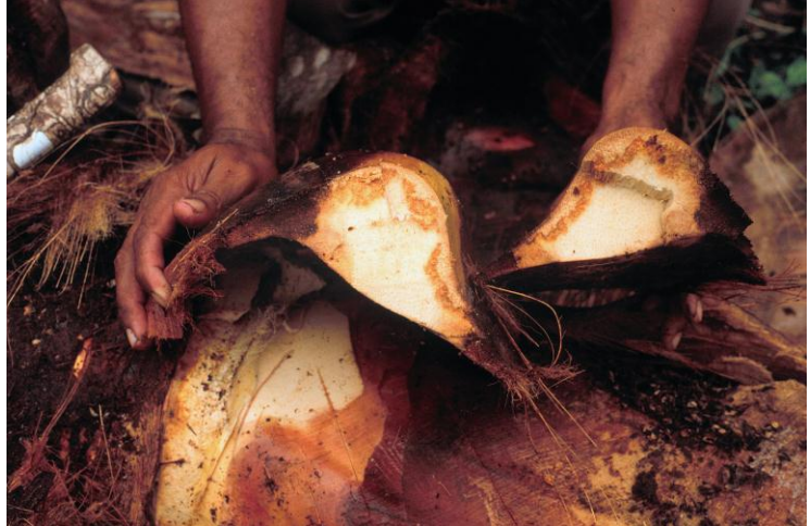
Figure 11. Coconut palm petioles with red ring disease, Ecuador (Image courtesy of Robin Giblin-Davis, University of Florida).

nematode can be found internally in the tracheal sacs or in the hemocoel among the gut tract loops. From these locations, the infective stage moves to the ovipositor of adult female weevils (Griffith, 1987). The adult weevils emerge from their cocoons in the rotted palm and disperse to apparently healthy or stressed and dying palms, completing the life-cycle. This pathogen can cause death of the plant 3-4 months after symptoms are evident (EPPO, 2005).