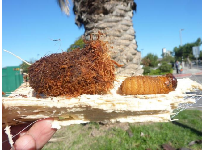
Figure 3. Prepupa of R. palmarum that was taken from its pupal cocoon (Image courtesy of Center for Invasive Species Research, University of California, Riverside).

After hatching, larvae bore into the stem where they tunnel vertically between the vascular bundles (Hagley, 1965). The larvae of R. palmarum feed on live