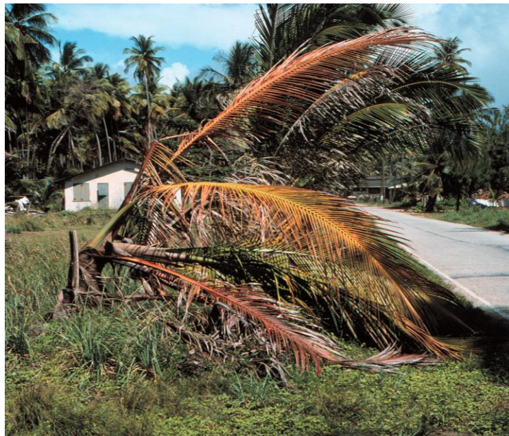
Figure 10. Coconut palm with red ring disease, Trinidad (Image courtesy of Robin Giblin-Davis, University of Florida).

In addition to directly damaging plant tissue, R. palmarum is the vector of the nematode Bursaphelenchus cocophilus (Griffith, 1987; Brammer and Crow, 2002). Bursaphelenchus cocophilus is the causal agent of the red-ring disease, which causes serious economic losses in palm plantations in South and Central America. Only female adults vector the nematode Bursaphelenchus cocophilus . Adult female weevils, which are internally infested with B. cocophilus , disperse to a healthy coconut palm and deposit the juvenile stage of the nematode during oviposition. Nematodes enter the wounds, feed, and reproduce in the palm tissues, causing the death of the infected trees. The weevil larvae are parasitized by juveniles of B. cocophilus , which persist in the insect through metamorphosis (EPPO, 2005). The infective stage of the