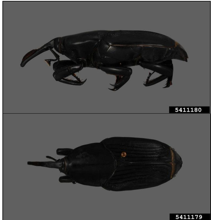
Figures 1 & 2. Adult R. palmarum (Image courtesy of Jennifer C. Giron Duque, University of Puerto Rico, Bugwood.org).

Larvae: “The larva is typically eruciform and [caterpillar-like and legless], and is 2.40 \pm 0.001 mm [0.09 in] long and 0.94 \pm 0.014 mm [0.04 in] wide in the first instar. The head is rich orange brown and bears a pair of stout mandibles. The abdomen is creamy white and semitransparent, each segment bearing distinct tufts of lateral setae. The later instars vary considerably in size. The mature larva is 51 \pm 5.6 mm [5 in] long and 25 \pm 3.8 mm [0.98 in] wide, with a [head] width of 8.06 \pm 0.43 mm [0.3 in]. At this stage the cuticle becomes considerably darker,