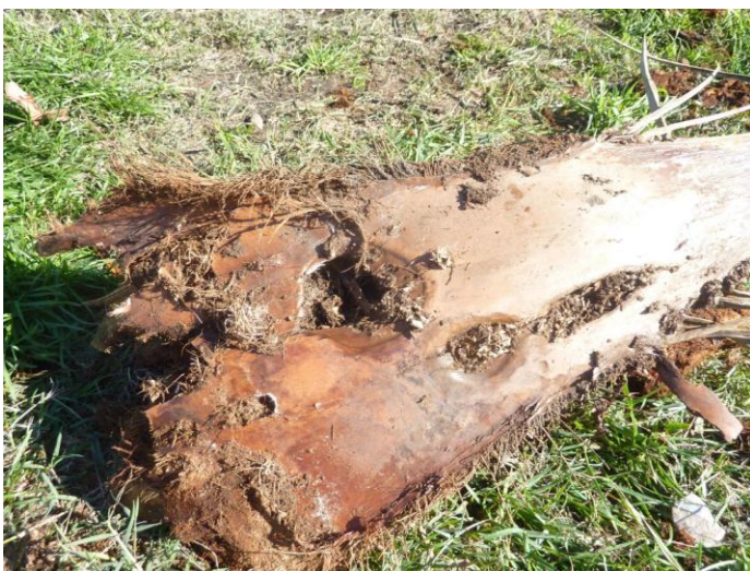
Figure 5. Palm frond damage caused by R. palmarum (Image courtesy of Center for Invasive Species Research, University of California, Riverside).

Infested palms show a progressive yellowing of the foliage. The emerging leaves are destroyed, and flowers are necrotic. The leaves dry out in ascending order in the crown, and the apical leaf bends and eventually drops. Galleries and damage to leaf-stems made by the larvae are easily detected in heavily infested plants. In coconut, larval tunnel openings and frass can be found at the bases of the leaf