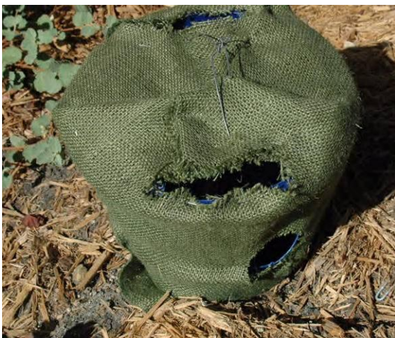
Figure 13. Homemade R. ferrugineus trap covered with burlap (Image courtesy of Amy Roda, USDA-APHIS).