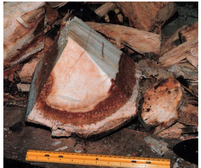
Figure 9. Red ring disease on coconut palm, Trinidad (Image courtesy of Robin Giblin-Davis, University of Florida).