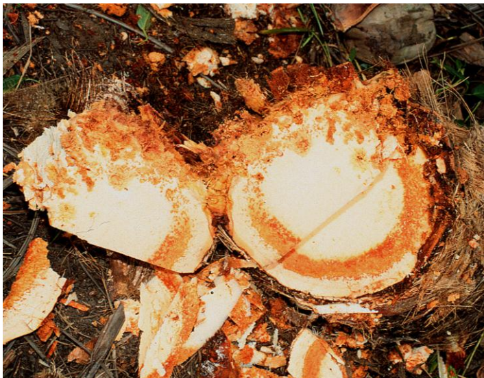
Figure 8. Red ring disease on coconut palm with R. palmarum galleries, Ecuador (Image courtesy of Robin Giblin-Davis, University of Florida).