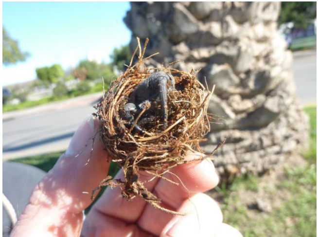
Figure 4. R. palmarum adult emerging from a pupal cocoon.