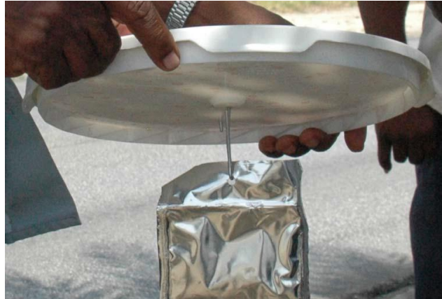
Figure 15. Lid of homemade bucket trap with hanging lure (Image courtesy of Amy Roda, USDA-APHIS).

Completely cover the food bait with a liquid solution. The liquid is critical as the weevils are attracted to the humidity and it prevents the weevils from crawling out of the trap. A 50 to 50 solution of propylene glycol (low-toxicity anti-freeze such as RV & Marine Antifreeze) and water helps minimize evaporation and the chance of the trap drying and the beetles escaping. Enough water and propylene glycol should be added to completely cover the bait and in a quantity that will remain until the next servicing date. Surrounding environmental conditions will dictate how quickly the trap will dry; and the quantity of liquid or frequency of servicing may need to be adjusted.