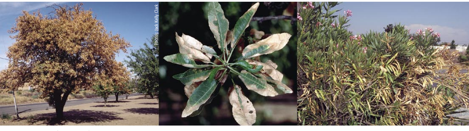
Almond leaf scorch, left and center , is a relatively slow-spreading disease that may take many years to establish in cropping systems. Right , oleander leaf scorch is causing millions of dollars of damage to California's freeway median strips and other ornamental plantings.

a single age showed that progeny production was greatest from GWSS eggs 3, 4 and 2 days old for G. ashmeadi, G. triguttatus and G. fasciatus, respectively. Furthermore, each parasitoid species was able to utilize a range of egg ages around their most preferred age: 1 to 4, 3 to 6, and 1 to 3 days old for G. ashmeadi, G. triguttatus and G. fasciatus, respectively. GWSS eggs that were parasitized at 8 to 10 days of age produced few parasitoid progeny and those that did emerge had been oviposited into sterile or dead host eggs lacking a GWSS embryo (Irvin and Hoddle 2005a). This suggests that the low production of parasitoid progeny in older GWSS eggs was most likely due to the advanced stage of development of the GWSS embryos.