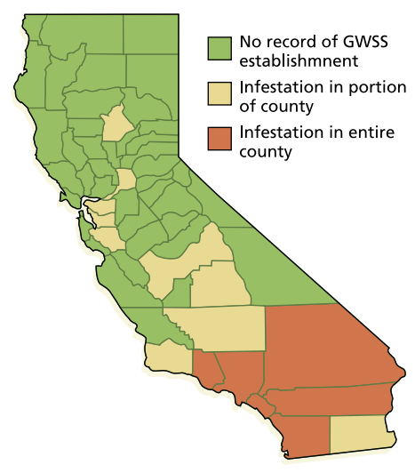
Fig. 1. GWSS establishment in California counties and infested parts of counties.

Two of these species ( G. morrilli and G. ashmeadi) are already established in California. G. morrilli is native to California and G. ashmeadi is self-introduced from the southeastern United States (with no direct assis-