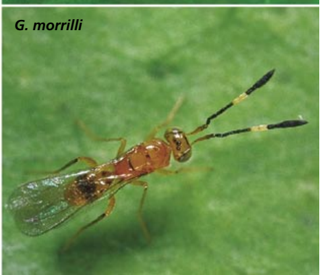
Parasitoids can aid in control of the glassywinged sharpshooter. Clockwise, from upper left: Gonatocerus ashmeadi is widespread in California and was most likely self-introduced from the southeastern United States and northeastern Mexico; G. triguttatus is a subtropical and tropical species introduced into California from Mexico and southeastern Texas; G. morrilli, native to Southern California, is having its genetic pool augmented with conspecifics collected from other U.S. regions; G. fasciatus is native to the southeast and Midwest and has gregarious reproductive habits.

USDA-ARS and CDFA have also been evaluating the safety of mymarid parasitoids imported from Argentina for possible use against GWSS in California. Quarantine work at UC Riverside indicates that Argentinean parasitoids will readily attack GWSS even though they did not evolve in the native range of GWSS. These evaluations are ongoing and no releases have been made.