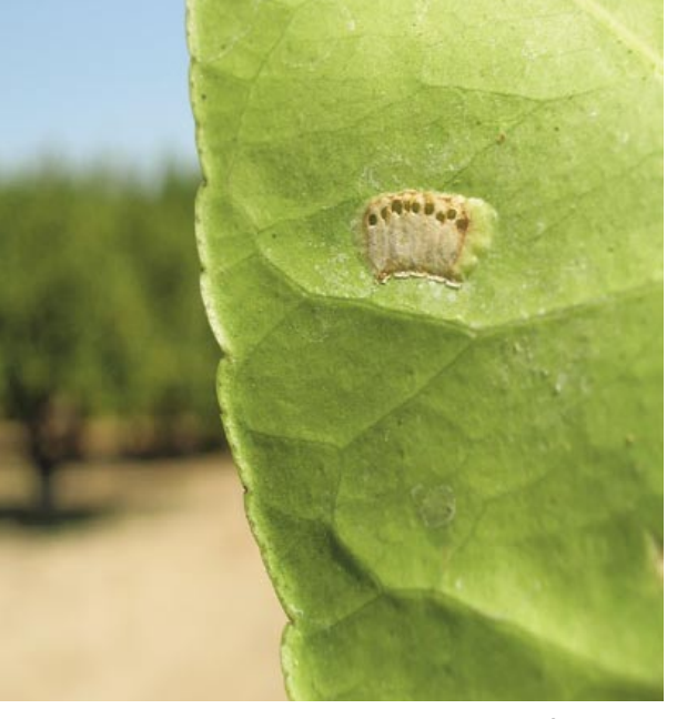
Parasitoid exit holes on a citrus leaf indicate that adults successfully chewed through the egg casing and leaf epidermis to emerge.