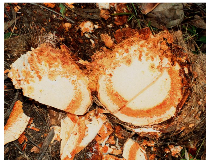
Figure 8. Red ring disease on coconut palm with R. palmarum galleries, Ecuador.

crosswise cut of the palm trunk at 0.3 to 2 m (1 to 6.6 ft) above the soil line shows the tell-tale red-ring symptom, which is a circular brick-red area in tall cultivars and usually browner in dwarf and hybrid cultivars (Griffith, 1987).