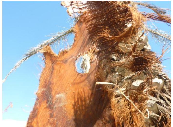
Figure 6. Damaged palm frond caused by R. palmarum (Image courtesy of Center for Invasive Species Research, University of California, Riverside).