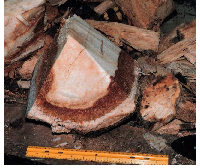
Figure 9. Red ring disease on coconut palm, Trinidad (Image courtesy of Robin Giblin-Davis, University of Florida).