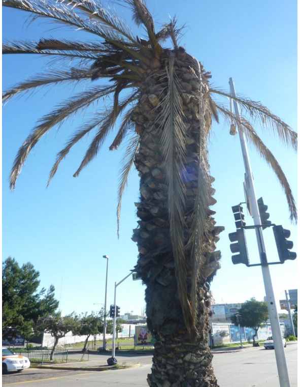
Figure 7. Canary Island palm killed by R. palmarum (Image courtesy of Center for Invasive Species Research, University of California, Riverside).

If the nematode B. cocophilus is present, a