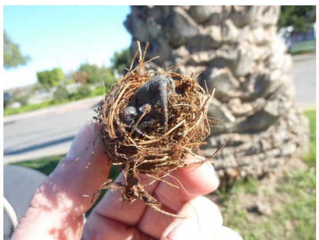
Figure 4. R. palmarum adult emerging from a pupal cocoon (Image courtesy of Center for Invasive Species Research, University of California, Riverside).

The life-cycle of R. palmarum in the coconut palm is about 80 days (Griffith, 1987) or 120 to 180 days, including 30 to 60 days as adult (Sánchez et al., 1993). The females are attracted to fresh trunk wounds and lay their eggs inside the plant tissue in a hole made with their rostrum. Eggs are laid near or on the internodal area of the palm trunk next to the crown.