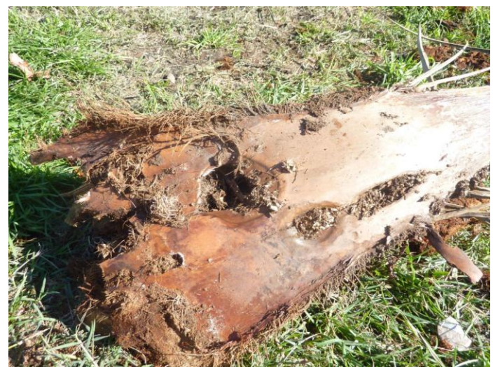
Figure 5. Palm frond damage caused by R. palmarum.

Infested palms show a progressive yellowing of the foliage. The emerging leaves are destroyed, and flowers are necrotic. The leaves dry out in ascending order in the crown, and the apical leaf bends and eventually drops. Galleries and damage to leaf-stems made by the larvae are easily detected in heavily infested plants. In coconut, larval tunnel openings and frass can be found at the bases of the leaf