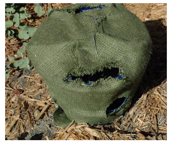
Figure 13. Homemade R. ferrugineus trap covered with burlap (Image courtesy of Amy Roda, USDA-APHIS).