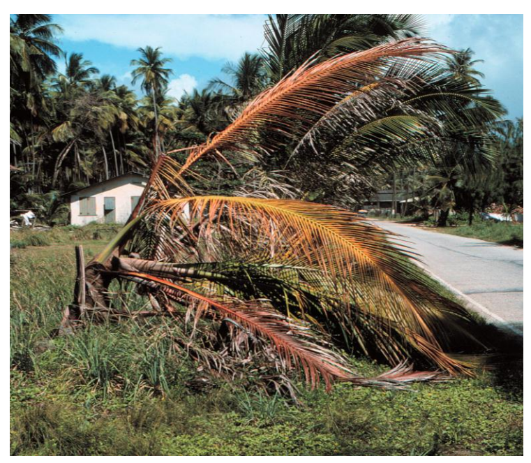
Figure 10. Coconut palm with red ring disease, Trinidad (Image courtesy of Robin Giblin-Davis, University of Florida).

In addition to directly damaging plant tissue, R. palmarum is the vector of the nematode Bursaphelenchus cocophilus (Griffith, 1987; Brammer and Crow, 2002). Bursaphelenchus cocophilus is the causal agent of the red-ring disease, which causes serious economic losses in palm plantations in South and Central America. Only female adults vector the nematode Bursaphelenchus cocophilus. Adult female weevils, which are internally infested with B . cocophilus , disperse to a healthy coconut palm and deposit the juvenile stage of the nematode during oviposition. Nematodes enter the wounds, feed, and