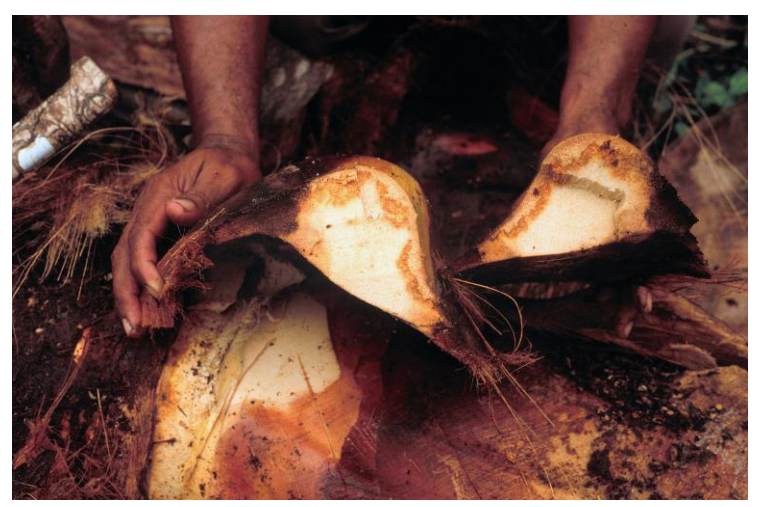
Figure 11. Coconut palm petioles with red ring disease, Ecuador.

nematode can be found internally in the tracheal sacs or in the hemocoel among the gut tract loops. From these locations, the infective stage moves to the ovipositor of adult female weevils (Griffith, 1987). The adult weevils emerge from their cocoons in the rotted palm and disperse to apparently healthy or stressed and dying palms, completing the life-cycle. This pathogen can cause death of the plant 3-4 months after symptoms are evident (EPPO, 2005).