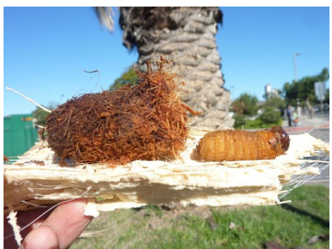
Figure 3. Prepupa of R. palmarum that was taken from its pupal cocoon.