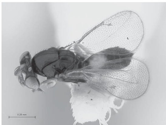
Fig. 2. Male Aprostocetus ( Aprostocetus ) sp. (all females were slide mounted for identification and were not photographed prior to mounting). The color version of this figure is available online in Florida Entomologist 96(2) (2013) at http://purl.fcla.edu/fcla/entomologist/browse .