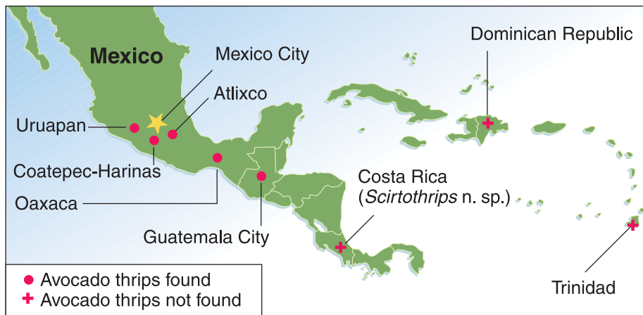
Fig. 1. Locations of foreign exploration for avocado thrips ( Scirtothrips perseae ) in Mexico and Central America.

In order to identify host-specific natural enemies that are climatically preadapted to California and successfully establish biological control of this pest, it is essential to determine the geographic distribution of avocado thrips in its native habitat. Our host-plant surveys in California indicate that avocado thrips feeds and reproduces only on avocados. We suspect that the natural range of this pest is closely correlated with the centers of origin of the host plant. Three distinguishable ecological races or subspecies of avocado ( Persea americana ) are recognized: (1) Mexican ( P. americana var. drymifolia ), (2) Guatemalan ( P. americana var. guatemalensis ) and (3) West Indian or Caribbean