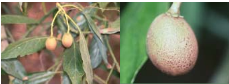
Economic losses from avocado thrips are the result of scarring on immature fruit by larvae and adults. Impacts include feeding damage, left, and alligator skin, right. While the edible flesh of avocados that mature with thrips damage is usually healthy, scarred fruit is often downgraded at the packinghouse.

Cultural and biological control. Combined field and laboratory studies indicate that approximately 77% of S. perseae larvae drop from avocado trees to pupate in the upper 2 inches of leaf duff beneath the tree canopy, before emerging as winged adults that fly back up into the canopy to commence feeding and reproduction. One strategy for increasing thrips pupation mortality rates beneath trees is to use composted organic yard waste for control of avocado root rot ( Phytophthora