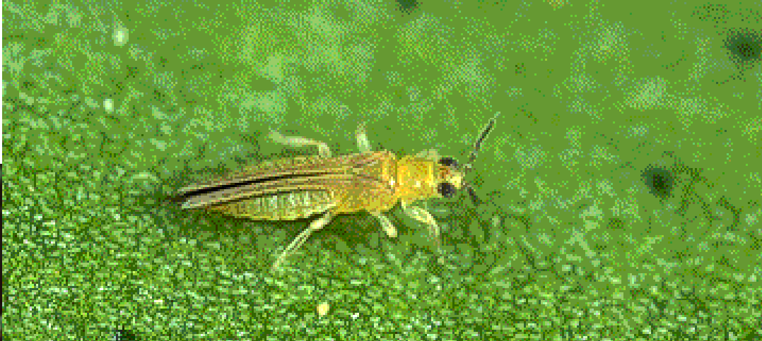
Avocado thrips, above (adult female), were first discovered in California in 1996. They have since become a major pest, with 80% of commercial orchards reportedly spraying to control them. On maturing fruit, left , avocado thrips cause elongate feeding scars.