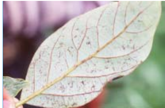
While individually quite small, avocado thrips can build up at such high densities on young leaves that premature leaf drop occurs. Larval and adult feeding damage is concentrated along the midrib and between veins on the leaf's underside.

Laboratory and field pesticide efficacy studies conducted on avocados in San Diego and Ventura counties identified three pesticides as being both efficacious and relatively selective: sabadilla (Veratran D, Dunhill Chemical Co.), abamectin (Agri-Mek, Syngenta) and spinosad (Success, Dow AgroSciences). With the assistance of the companies producing these materials, the California Avocado Commission, and the California Department of Pesticide Regulation, we worked toward making all three pesticides available for use by avocado growers so that the materials could be used in rotation to avoid the development of pesticide resistance (historically a serious problem with pestiferous thrips species).