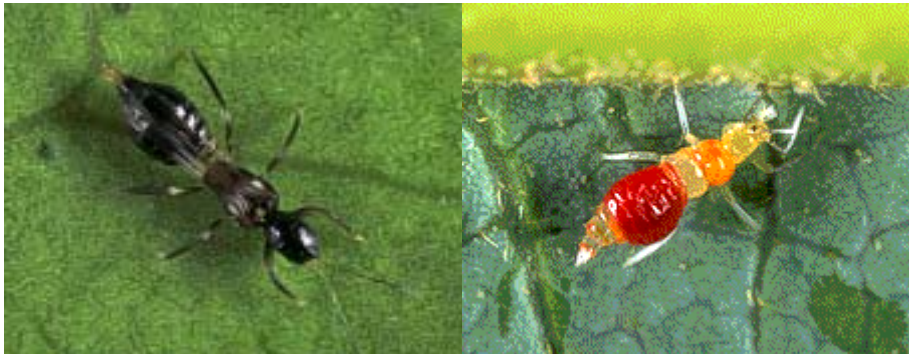
The researchers scoured Mexican and Central American avocado orchards for natural predators of avocado thrips. They found the predatory thrips Franklinothrips orizabensis , left (larva) and right (adult). Also native to California, this predator is now being reared and tested as a possible biological control agent.